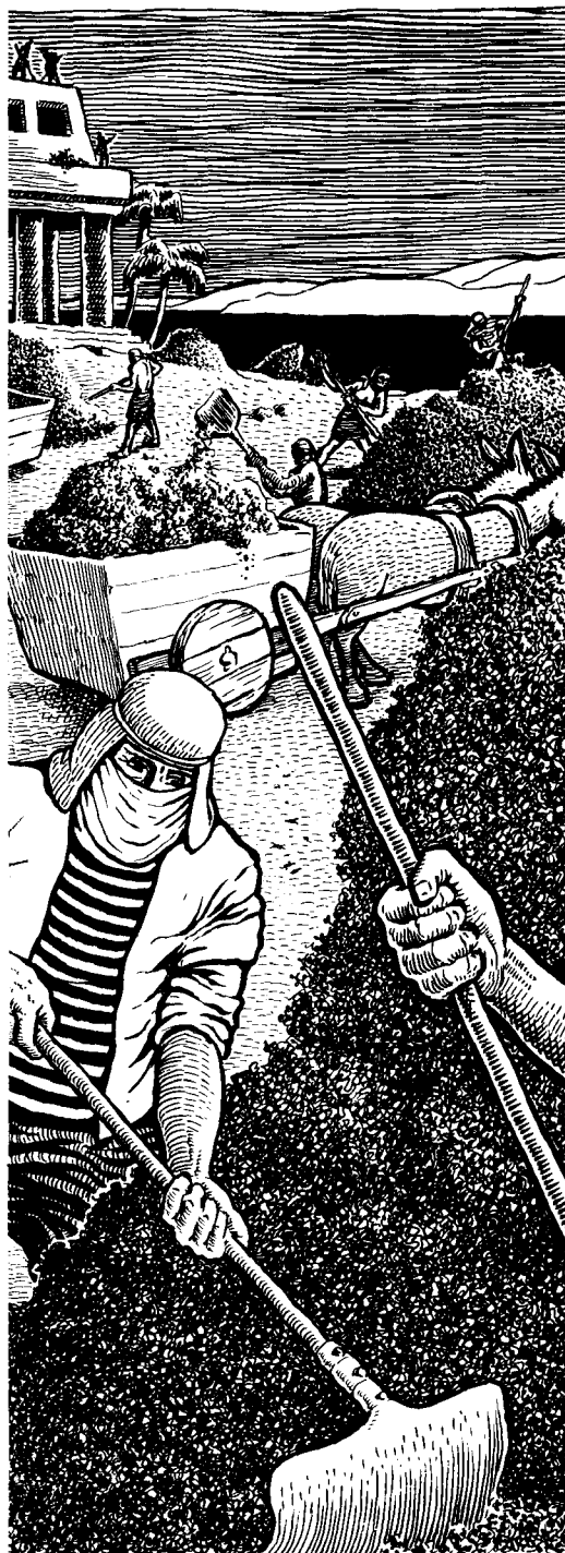
The Egyptians were still working hard to clean up the heaps of dead frogs when Moses warned of a Third Plague to come.

“Do something!” he commanded. “Prove again that our gods can produce miracles!”