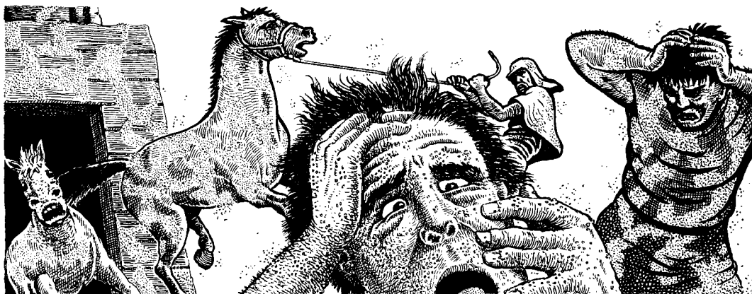
People and animals moaned in agony as their bodies became matted with the stinging insects.

Perhaps the magicians had performed their former amazing tricks through clever, natural means. Perhaps they had been helped by evil spirits. Or possibly there was a combination of both. Whatever the means, it didn't seem to be with them as they stood in fearful embarrassment before the king. The head magician suddenly bowed low, and it was plain that he was trembling.